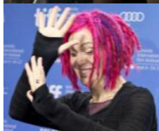
Recently added to the collection: "Mile End Lesbian" Zoé Cousineau gives a testimonial in La Presse ; Lana Wachowski comes out as transgender at the Toronto International Film Festival.