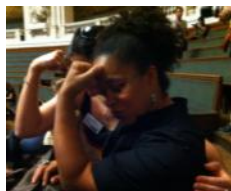
Deep in thought at the Sorbonne ...